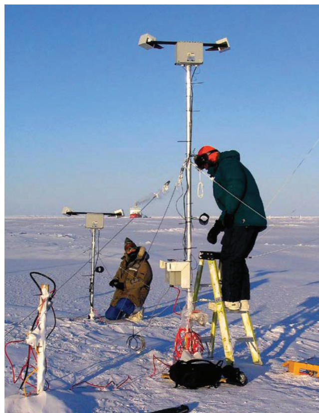
Arctic station testing.

Networks of Centres of Excellence supports large collaborative networks to bring researchers and industry together through 48 active networks.